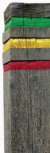
Marker posts with different coloured symbols mark the hiking routes in Sybergländ.